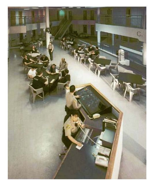
Newer, direct supervision jail module.

The North County Detention Facility (NCDF) is located north of Santa Rosa at 2254 Ordinance Road, adjacent to the Sonoma County Airport. This is a minimum-to-medium security facility, and at one time functioned as the 'Honor Farm' (low security jail). The NCDF has a maximum capacity of 533 inmates, housed in 8 separate modules, 1 for females and 7 for males. Two of these modules are dormitories with more than 100 beds each, in which well-behaved inmates may be housed under minimum security conditions. The majority of the inmates in the NCDF have been sentenced by the courts, and are already serving their terms (of up to a 1 year maximum). They have, therefore, less incentive to do anything that would interfere with the completion of their sentences. Together the board-rated capacity of both the MADF and the NCDF is for a total of 1286 beds.