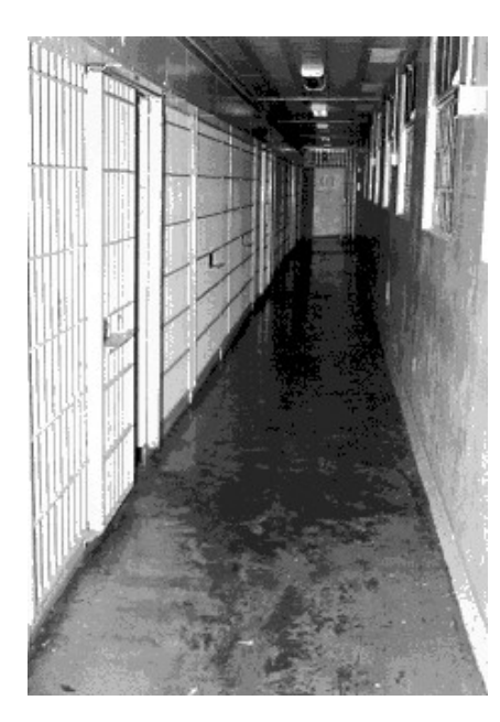
Old style "linear" iail.

Over the period 1996-2003 four different grand juries investigated mental and physical health care in the jails. Recent information indicates that the jails are nearly full again, and that the composition of the population has changed with continued increases in the number of the mentally ill and gang members.