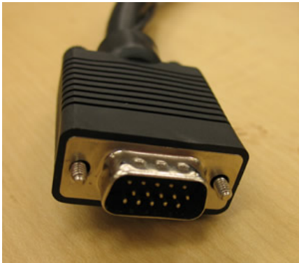
VGA Connector (Laptop)