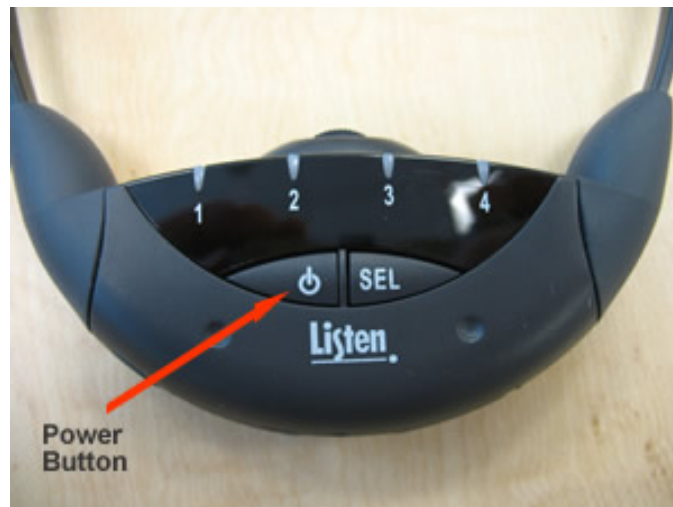
Listen LR-42 Infrared Assistive Listening Headset