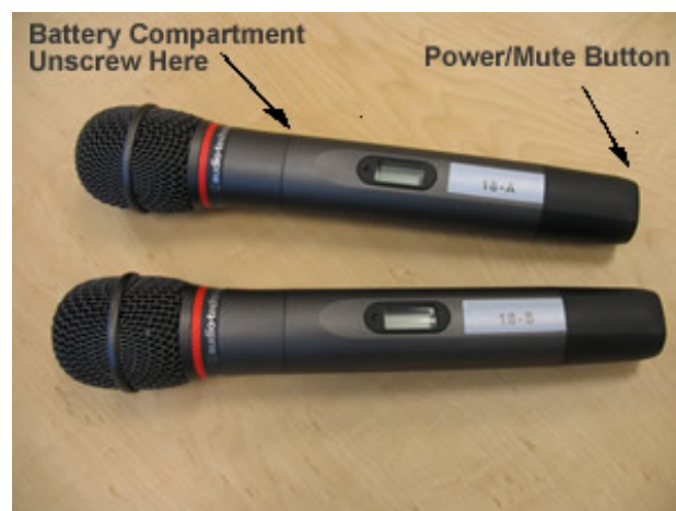
Audio Technica ATW-T341 Wireless Handheld Microphones

ATW-T341 Wireless microphones are available in Courtroom 18 and 19 (2 per courtroom). Please check with courtroom clerk for any requests to use these microphones. They are battery powered and have a combination Power/Mute button at one end of the microphone barrel.