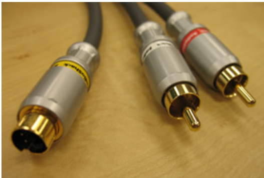
S Video Cable