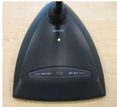
Shure MX418C/C Desktop Microphone

ATW-T341 Wireless microphones are available in Courtroom 18 and 19 (2 per courtroom). Please check with courtroom clerk for any requests to use these microphones. They are battery powered and have a combination Power/Mute button at one end of the microphone barrel.