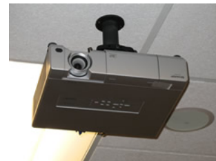
Sharp PG-D4010X Video Projector