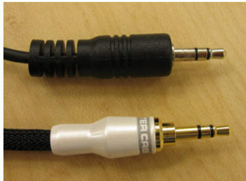
Examples: 3.5 mm Stereo Audio Jacks