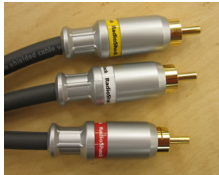
Composite Video Cable