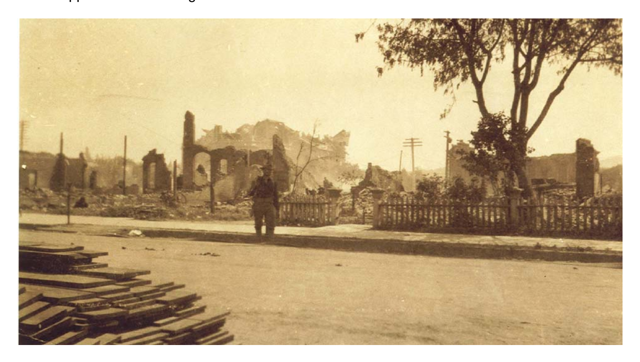
Santa Rosa after the Earthquake and Fire, April 18, 1906

The earthquake of April 18, 1906, although known as the earthquake of San Francisco, reduced downtown Santa Rosa to rubble. The greatest loss of life occurred in the hotels and rooming houses of the 52-year old community. A fire immediately followed the quake, killing those who were trapped in the wreckage.