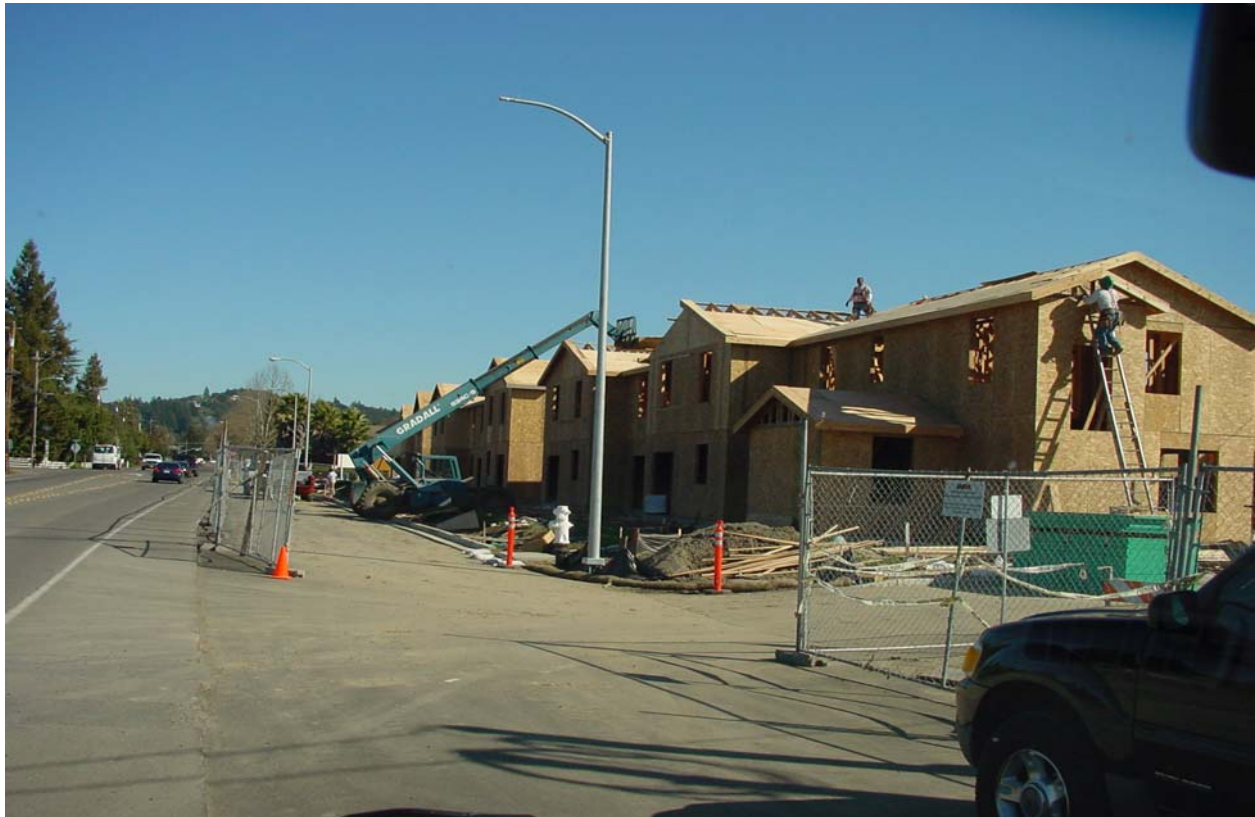
Housing Construction Site

It should be noted here, that the Housing Element is subject to stringent rules determined by the State Department of Housing and Community Development. The County failed to meet these State mandates with updates of the Housing Element performed in 1992 and 1996. In 1998 the County was sued over the adequacy of the Element by a consortium of housing advocacy groups. The Court, in December 2000, found the Element inadequate in four specific areas and directed the County to adopt a new Element by August 2001. A moratorium on approval of new