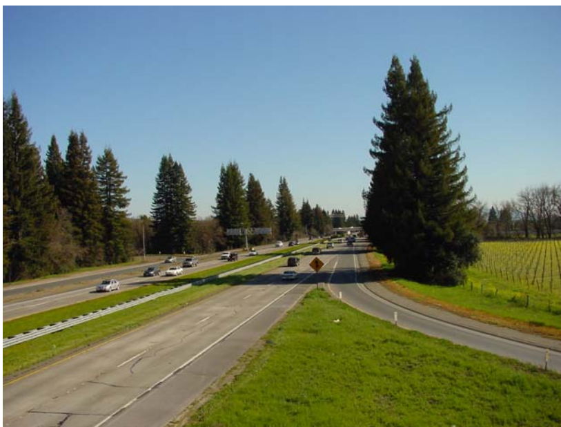
Highway 101 North of Santa Rosa

After three and a half years of work, and over two years of public hearings, a General Plan was adopted in 1989, and was designed to expire after 15 years, i.e. in 2004. Two appointed citizens committees participated in the development of the '89 Plan. Extensive public involvement through workshops and public hearings resulted in a Plan that balances the many diverse and sometimes-competing community interests.