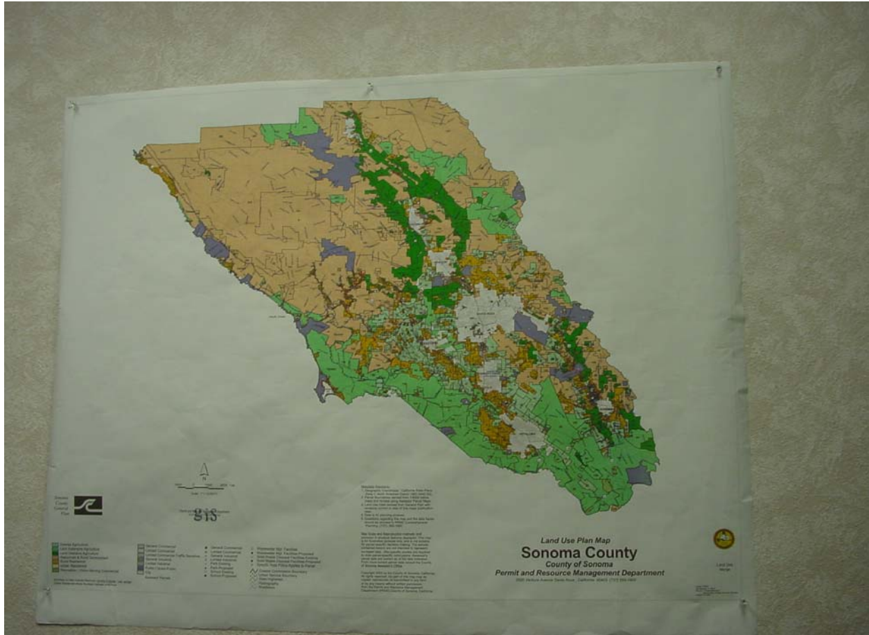
Sonoma County Land Use Plan Map

All Sonoma County residents should take a look at this map. Expert chart readers will probably recognize it as a map of Sonoma County. But what are the colors all about? Try as hard as you can, the index in this picture is too small to decipher. However, the title of the map as listed just